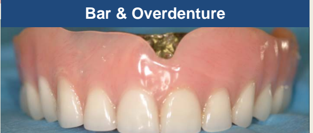
Bar & Overdenture