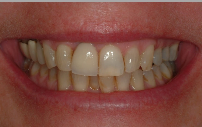
Final Implant Crown #8

These complications could have been avoided.