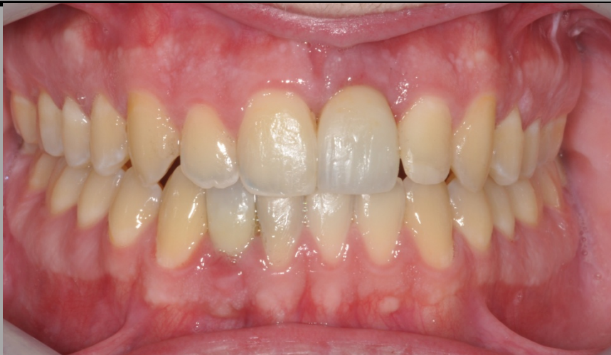
Final Implant Crown #9