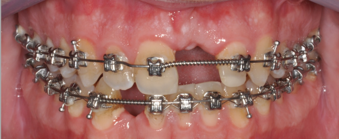
During Orthodontic Therapy