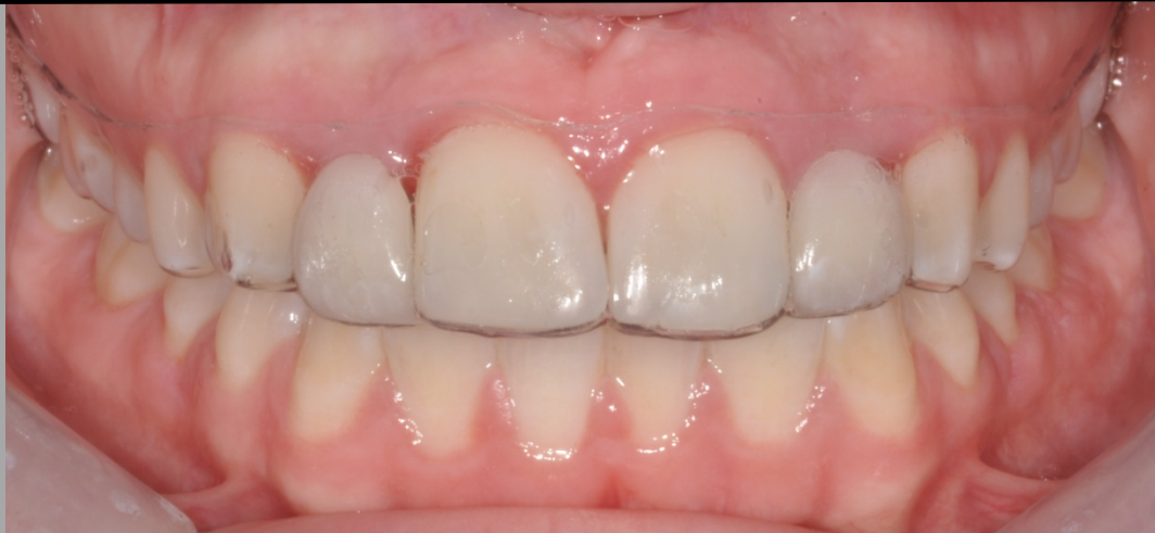
While Waiting for Growth to Cease