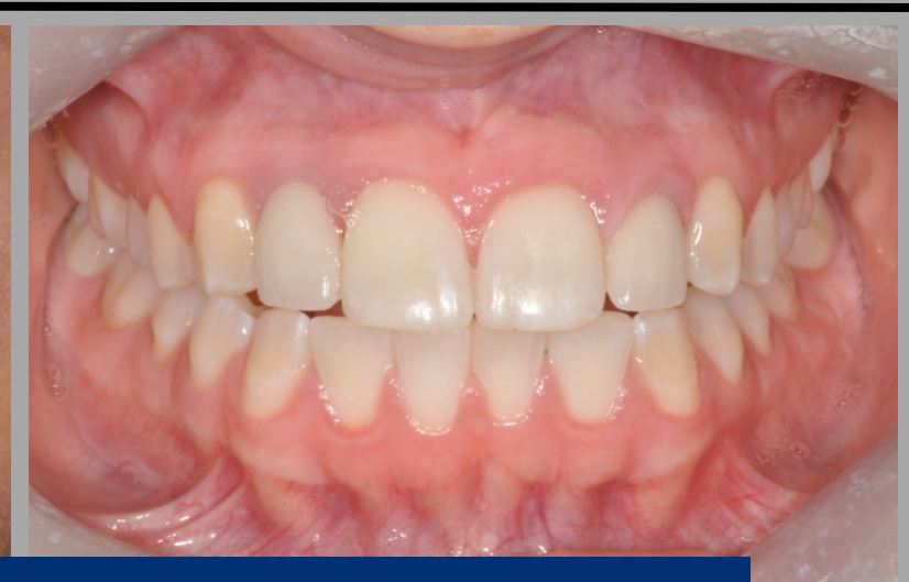
Final Implant Crown #7 & #10

Testimonial: ““I was scared at the beginning when I needed bone grafting, but was relieved that the rest of the procedures were easier. The final result was amazing and well worth my wait!!!”