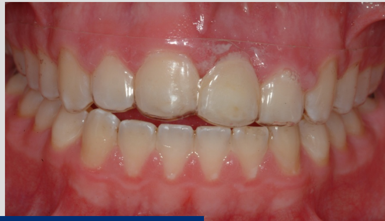
During Treatment (essix appliance)