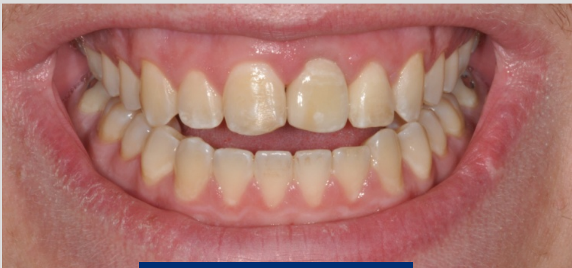
Final Implant Crown #9