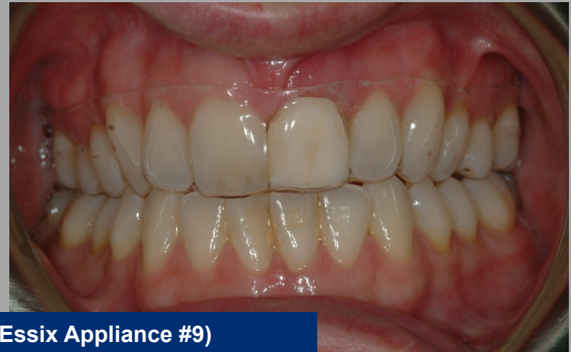
During Treatment (Essix Appliance #9)