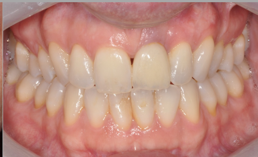
Final Tooth Implant Crown #9